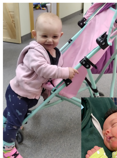
Our first 2021 Baby

When I first moved to Haliburton I found out I was newly pregnant with my first child. I soon learned about the Centre and all that they offer. I made an appointment with them. The women in the Centre were very warm and welcoming right from the start, they are always there to be an ear to listen to. The Centre has helped my new family and I in many ways. They have given us large items we needed for our nursery, smaller items like clothing and diapers. Whenever we are in need of something they almost always have it and we are forever grateful for the women in there. The Pregnancy Care Centre means a lot to me and I will always give back what I can.