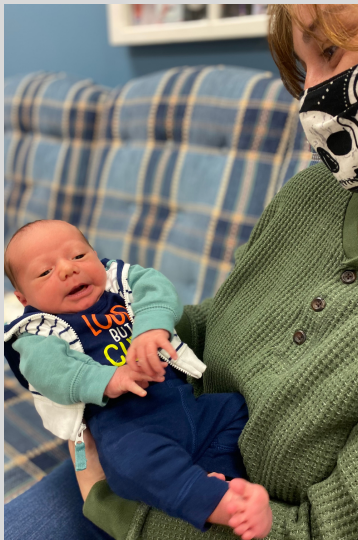
One of our spring babies

"It is stressful becoming a parent for the first time, especially when you are a single parent, but it has been even more stressful with Covid. I felt fortunate to find out about the Pregnancy Care Centre during the final months of my pregnancy. Everyone from the Centre was very friendly and helpful. The weekly emails made me feel as though someone was looking out for me. Since I don't have family nearby it was great to know that they were just a phone call away if I needed any help. As a new mom I didn't always know what my baby would need so it was great to be able to have access to the centre. This was especially helpful because it has been incredibly challenging to go shopping with a baby during Covid lockdowns and I appreciate being able to save some money by accessing second hand items in fairly good condition. I was incredibly thankful that the Centre remained open during the pandemic and did not shut down their services. I wish all moms everywhere could have access to Centres like these with such caring and compassionate staff because they certainly have helped to make my life a little easier during a very stressful time."